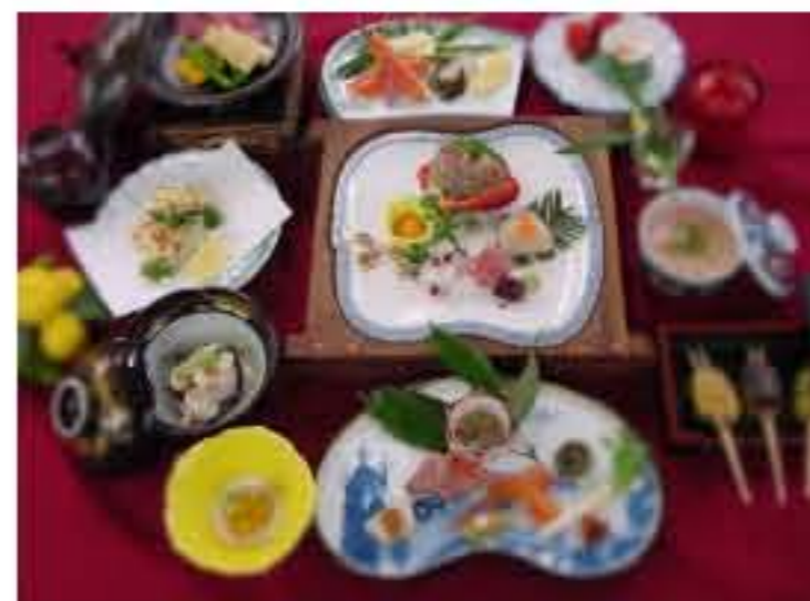
Kaiseki cuisine (change by a season)